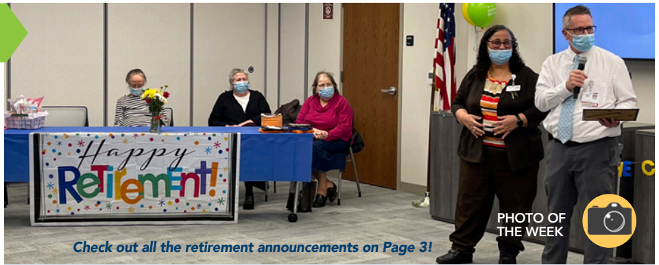
Check out all the retirement announcements on Page 3!

A Weekly Update For The Employees of North Central Health Care